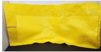
WATER HOG® WIZARD FOR SPILL BUCKETS