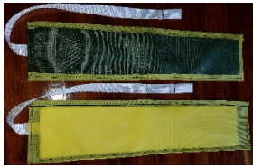
WATER HOG® HI-STANDARD FOR UDC's and SUMPS