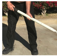
WATER HOG® INTERSTITIAL DEVICE – “ISD” FOR INTERSTITIAL SPACES