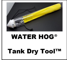
WATER HOG® Tank Dry Tool™