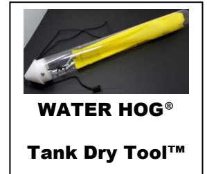
WATER HOG® Tank Dry Tool™